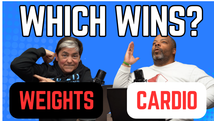
Cardio vs Weight Lifting

Top-performing episodes by unique Apple Podcasts listeners.