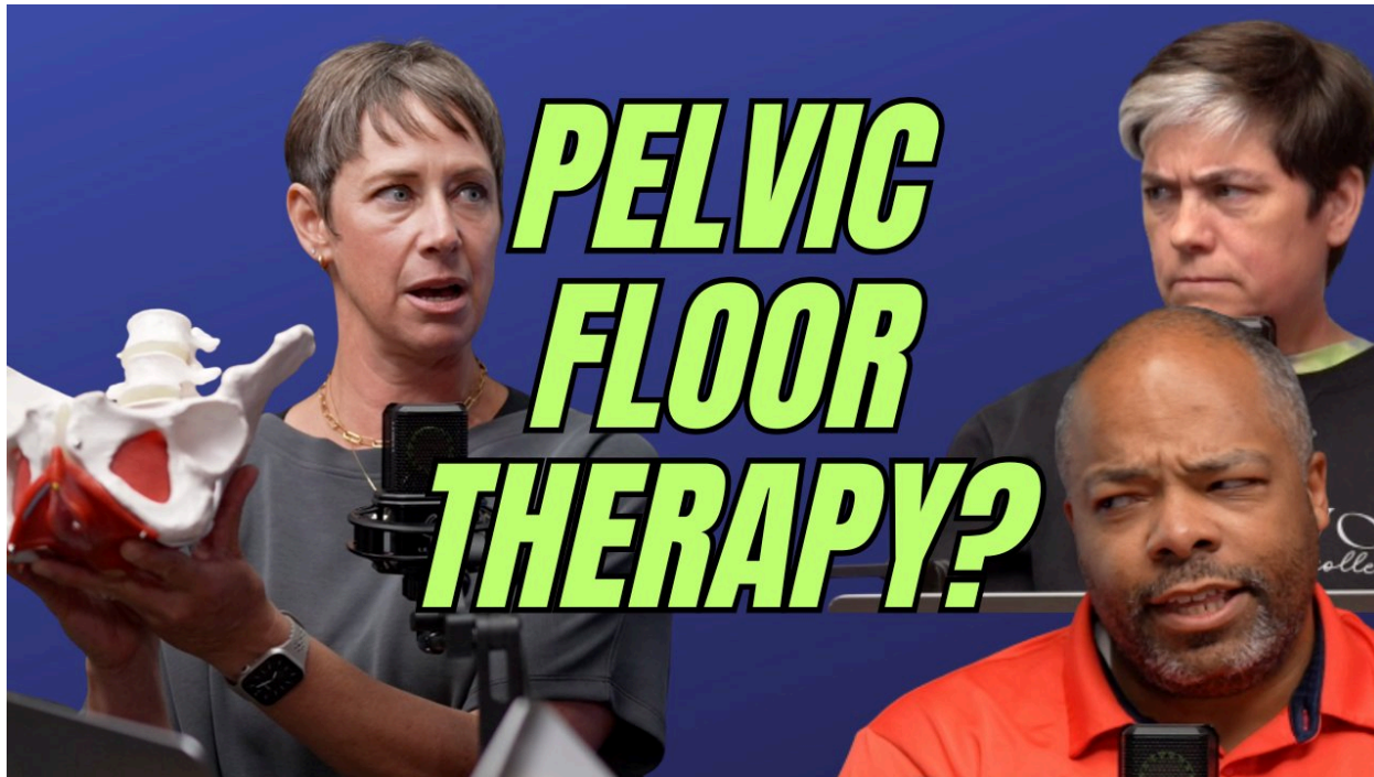
Photo: The PTCH Podcast studio, Corvallis OR

Between them, decades of hands-on patient care.